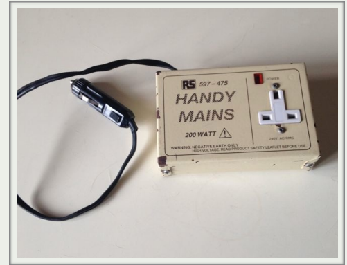
An inverter to power equipment in the car.